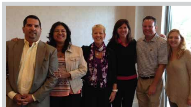
NJNAHU GOLF OUTING