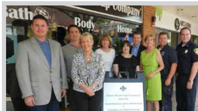
CRANFORD NIGHT ON THE TOWN