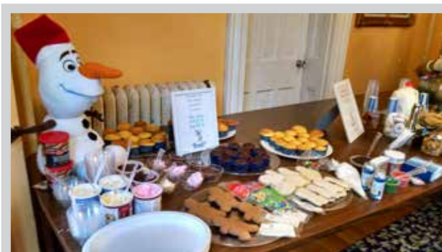
COOKIES AND HOT COCOA PARTY