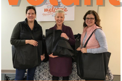
Junior League of Elizabeth-Plainfield

In March, the Junior League provided sixty tote bags containing activity books, snacks, and toiletries for our Family Justice Center and Crisis Response Teams clients. Mothers and their children use these bags while they are waiting in court.