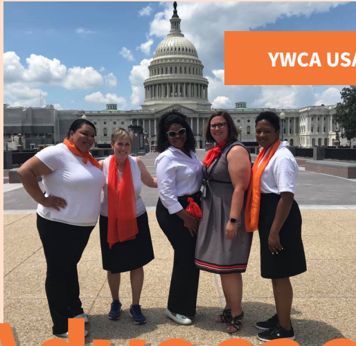
YWCA USA National Meeting

In June, staff and board members of the YWCA Union County attended the YWCA USA's Capitol Hill Day and National Meeting in Washington DC. Our team joined our sister associations in New Jersey to meet with our NJ Senators and Congresspersons to advocate for issues that affect our constituents such as the renewal of The Violence Against Women Act, affordable childcare, and others. After a day on the Hill, the opening reception of the national meeting was held at the Smithsonian National Museum of African American History and Culture.