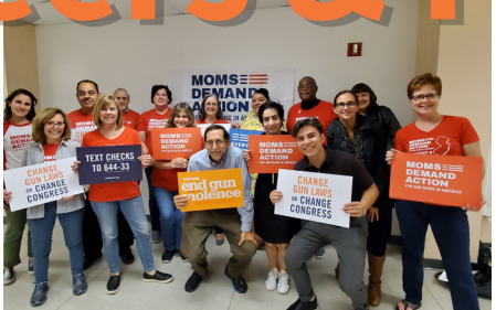
Moms Demand Action

In March, the Junior League provided sixty tote bags containing activity books, snacks, and toiletries for our Family Justice Center and Crisis Response Teams clients. Mothers and their children use these bags while they are waiting in court.