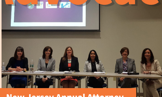
New Jersey Annual Attorney General's Conference

In June, staff and board members of the YWCA Union County attended the YWCA USA's Capitol Hill Day and National Meeting in Washington DC. Our team joined our sister associations in New Jersey to meet with our NJ Senators and Congresspersons to advocate for issues that affect our constituents such as the renewal of The Violence Against Women Act, affordable childcare, and others. After a day on the Hill, the opening reception of the national meeting was held at the Smithsonian National Museum of African American History and Culture.