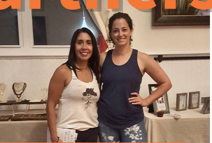
Newcomers Club of Westfield

YWCA teamed up with Union County Moms Demand Action to hold an "In Her Shoes" workshop during Domestic Violence Awareness Month in October. In Her Shoes is an interactive exercise to give participants a better understanding of the choices and experiences of victims of domestic violence.