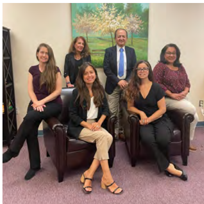
2022 PALS Program Staff